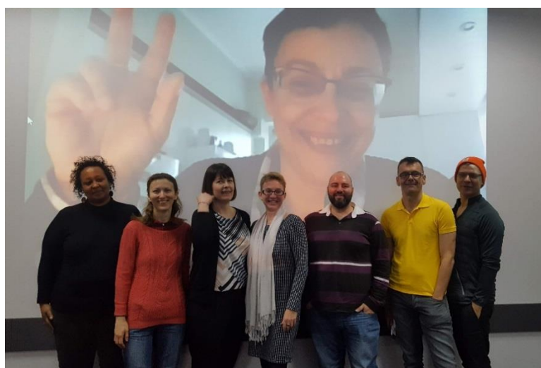
Photos of SC and Stakeholder Meetings in Kyiv'19