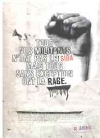
All our militants aren't HIV+, but they all are outraged - 2009

At the heart of AIDES' values and principles are its community-based dimension, social change, non-governmental action, respect for individuals, confidentiality and non-judgement