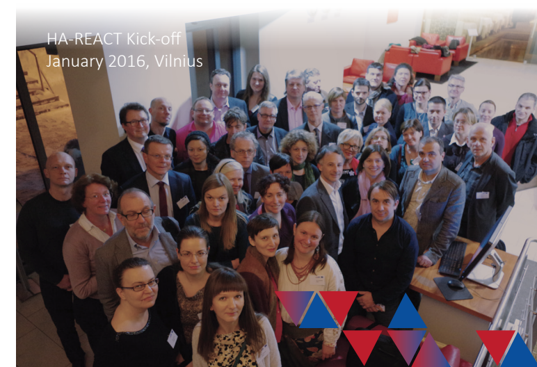
HA-REACT Kick-off January 2016, Vilnius