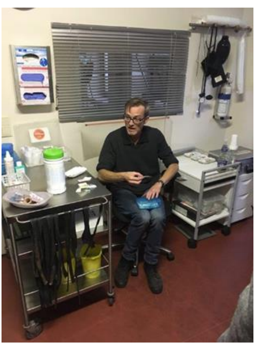
Additionally, outreach workers distributed 42,691 syringes and needles and 9,769 condoms in this time period.