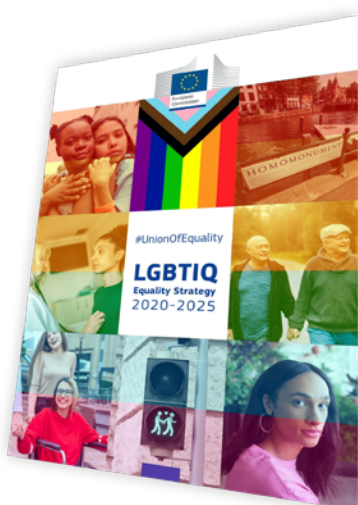
EU LGBTIQ Equality Strategy (2020-2025)

The EU LGBTIQ Equality Strategy is an important symbol of a cohesive commitment by the European Commission towards achieving equality for LGBTIQ people in the EU. TGEU welcomed its release in 2020, noting that the strategy “signals a new level of awareness and commitment of the European Union for the equality of LGBTIQ people. TGEU, alongside other stakeholders, has been for