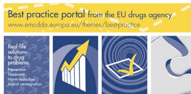
Best practice portal - HR section