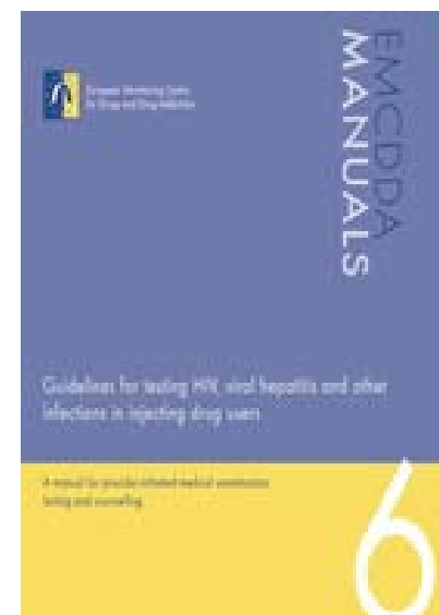
DRID testing guidelines