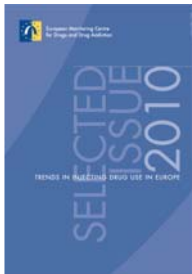
Selected issue on IDU