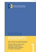
Insight on HAT