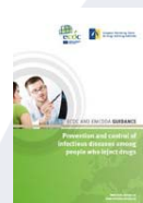
ECDC and EMCDDA guidance.

Prevention and control of infectious diseases among people who inject drugs