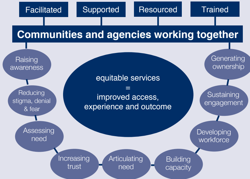
Figure 1. Centre for Ethnicity and Health Community Engagement Model